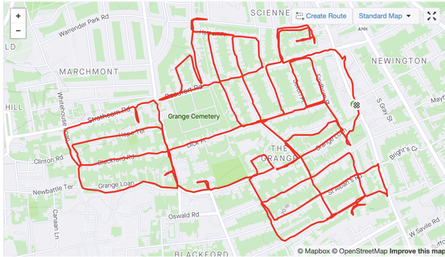
Figure 3: Every street of The Grange, Edinburgh, Scotland run according the algorithm

Dijkstra, Edmonds matching and Hierholzer. Each of these algorithms has polynomial complexity. Dijkstra algorithm has complexity \Theta(|E| + |N| \log(|N|)) [11], Hierholzer has O(|E|) and it is purely dependent on number of edges [10]. The most computationally heavy algorithm is Edmonds maximal matching algorithm with complexity O(|N|^3) [12, 13]. Therefore, #everystreet algorithm has complexity O(|N|^3) .