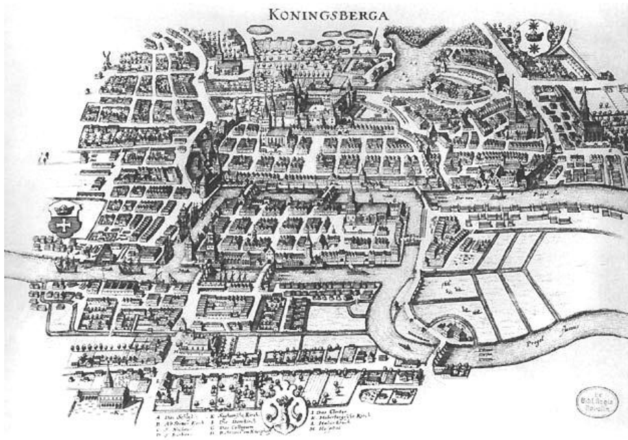
Figure 1: Map of East Prussian Königsberg from 1651 showing river Pregel with two islands ( Kneiphof and Lomse ) connected by seven bridges. [8]

the rules are simple and clear, but the problem is the street definition. How do we define a street? Do we include pedestrian paths, parks or highways? For simplicity, we consider a street network of edges and nodes (interception of two or more edges and dead-end roads) accessible by car. Assuming that runner 3 can run oneway roads in both direction, we do not consider road direction. In order to find such network we used Open Street Map API [4] with drive layer.